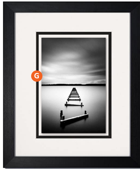
Double Mat (optional) Floating Image (optional)