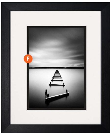
Double Mat. Accent Mat Is Black (optional)